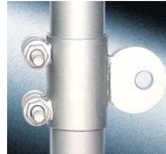
super-grip heavy duty bracket