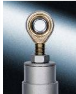
Industrial grade rod end